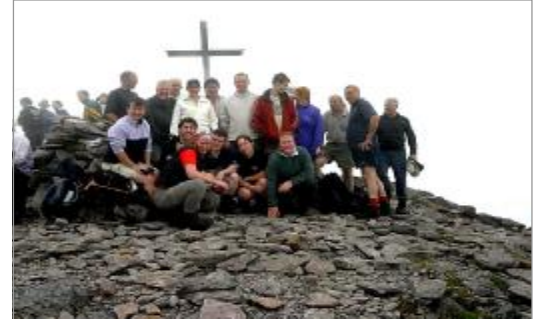
Members of the South Dublin expedition team in training for Kilimanjaro, pictured at the summit of Carrauntoohil: 'The Roof of Ireland', at a mere 1,038 mtrs, compared to 'The Roof of Africa' at 5,895 mtrs.

Following the completion of the climb, the team will return to Kenya, to visit education and aid projects supported by