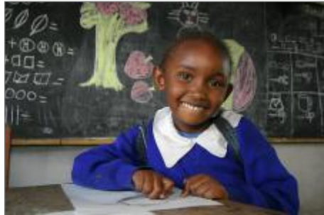
Schoolchildren are taught the importance of their environment. However, in the slum villages, they see very little practical example in action.

Mukuru Skills Training Centre is a new project in Lunga Lunga, funded by ChildAid . As well as offering some practical training in skills like hairdressing and crafts, the project actively promotes waste management,