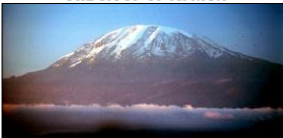
Towering above the cloudline to a height of 5,895 mtrs, Kilimanjaro is truly a majestic mountain, as seen from the African Plains